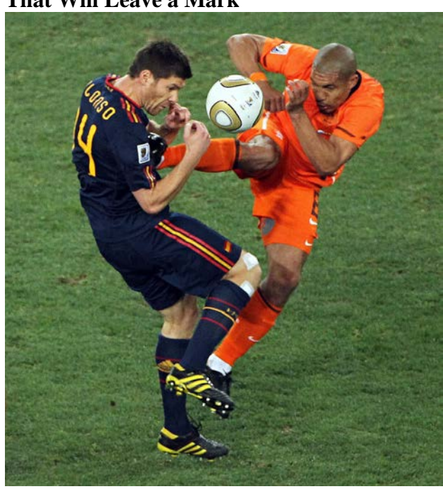
This Doesn't Look Too Good Either