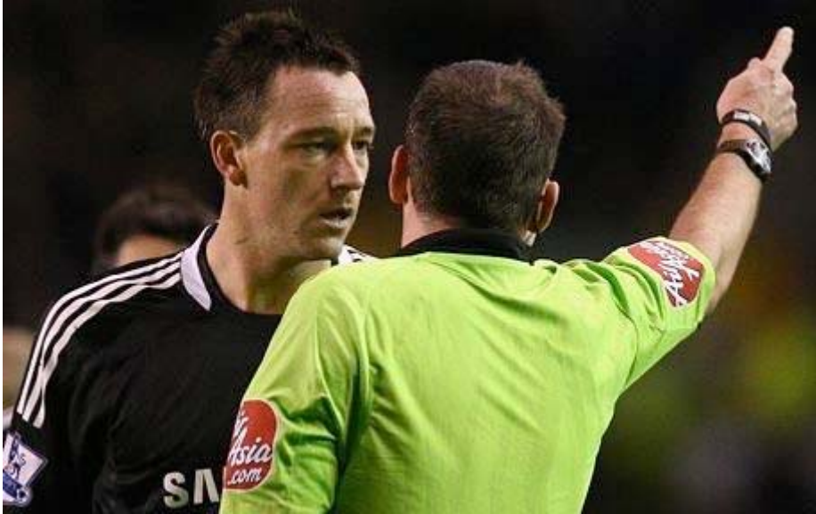
Phil Dowd sends off Chelsea captain John Terry at Goodison Park