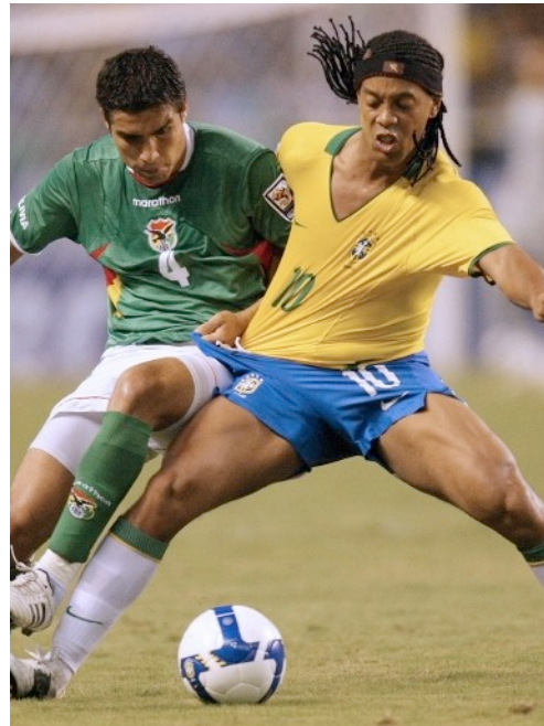
No shirt grab here against Ronaldhino