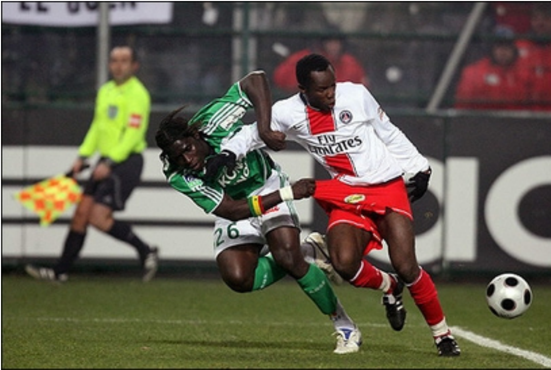
It May be Time for the A.R. to Start Waving his Flag (recent French League match)