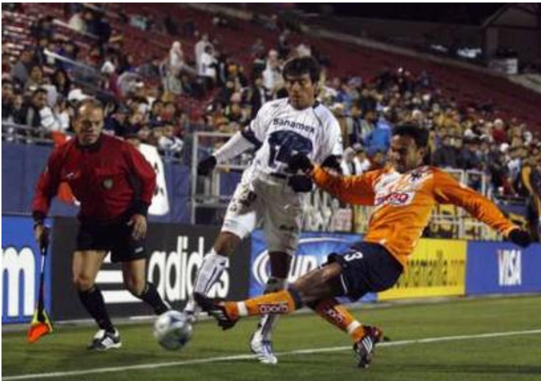
This A.R. is on the Job (recent interliga match action)