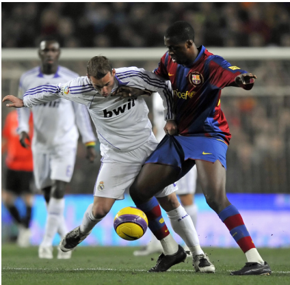
A Tough Challenge (recent Barcelona-Real Madrid match)